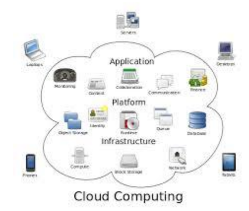
Figure 1: Cloud Architecture.

Cloud computing is used to describe the variety of different types of computing concepts that involves large number of computers that are connected through a real time communication network. Cloud computing is a jargon term without a commonly accepted non-ambiguous scientific or technical definition. In science, cloud computing is a synonym for distributed computing over a network and means the ability to run a program on many connected computers at the same time. The popularity of the term can be attributed to its use in marketing to sell hosted services in the sense of application service provisioning that run client server software on a remote location.